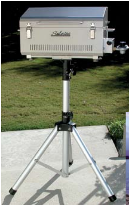
Optional Tripod Stand

Includes carry bag with double shoulder straps and pockets to hold three 1 lb. propane bottles. Optional tripod stand is perfect for use on your deck or patio. Folds for easy transport, making it great for RVs, camping and tailgating.